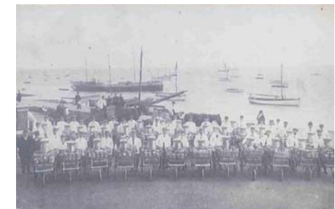
Remember Abbotts Bros Dairy in the Broadway – well here they are in all their glory – looks like deliveries started from the Old Town.